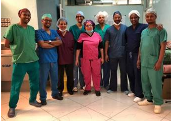
Volunteers with Bridging Ethiopia who work to bridge the gap on healthcare.

Ethiopia has invested about $11 billion over the past 20 years on building roads and budgeted an additional $1.7 billion this year for these efforts. This spending has increased economic growth in a dramatic way. The annual Gross Domestic Product has gone up tenfold in the past 15 years, due in a large part to the investment in funds toward these efforts. This ongoing endeavor will be accomplished by empowering local healthcare providers and leaders in the health ministry of Ethiopia. In addition, there is significant support from the University of Missouri School of Medicine to collaborate with the Addis Ababa University School of Medicine.